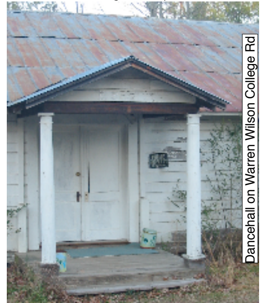
Dancehall on Warren Wilson College Rd