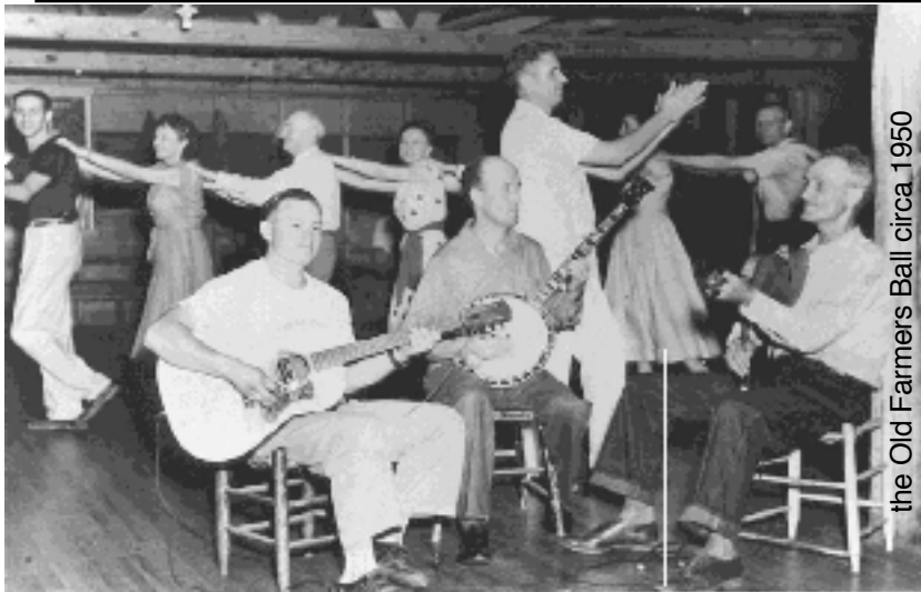
the Old Farmers Ball circa. 1950